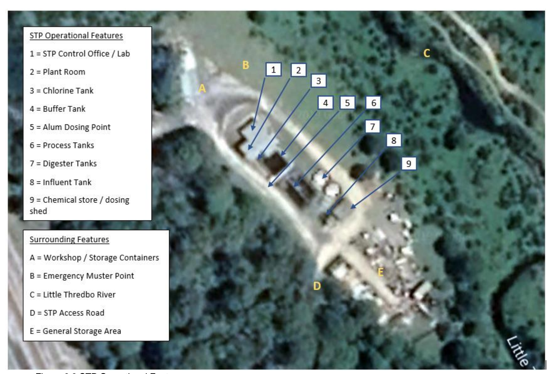
Figure 9.3 STP Operational Features