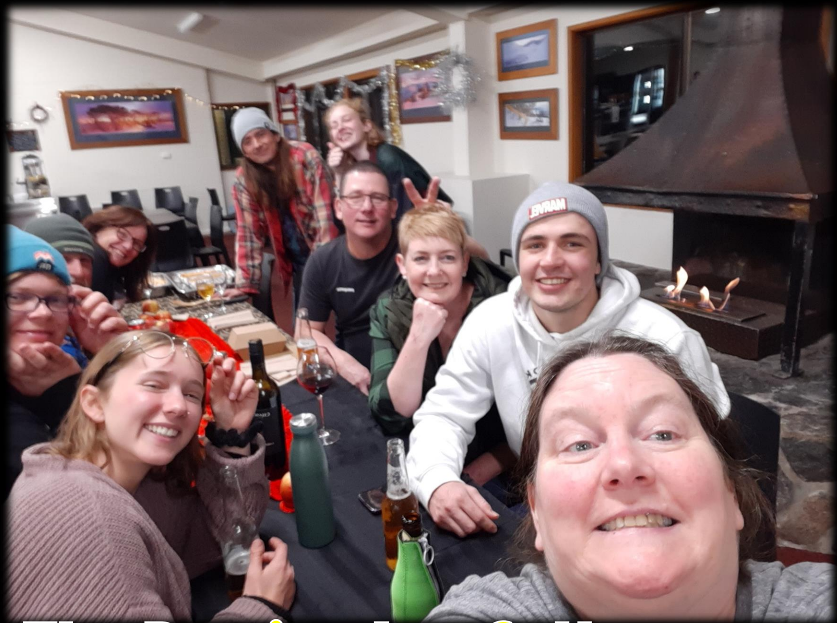
The Burning log Guthega